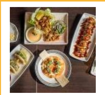
Japanese 'dude' food: Think sashimi pizzas and wagyu beef burgers! Christmas BAObles: Bao in colourful Christmas themed shapes – perfect for hanging on your tree!