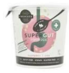
Supergut porridge with 3x more fibre than standard oats