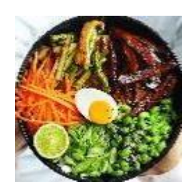
Vegan egg: Wagamama launch dish with worlds first vegan 'egg' Vegan classics: Pret set to launch vegan versions of top sandwiches including Chuna mayo, hoisin mushroom and the VLT