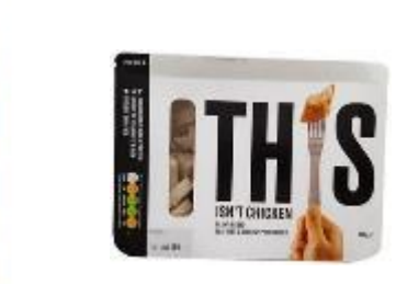
Lactofree dairy & oat This isn't Chicken (but milk hybrid tastes like it!)