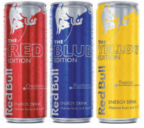
> There has been a resurgence in tropical flavors, with the recent launch of Red Bull Yellow Edition with tropical fruits (right).

Flavors innovators are therefore mixing and matching flavor combinations like never before and taking fruit flavors into non-traditional applications. There has been a resurgence in tropical flavors, with the recent launch of Red Bull Yellow Edition with tropical fruits, following a successful limited edition launch in July and August of 2014. The introduction comes as the number of soft drinks products with a tropical flavor continues to rise steadily.